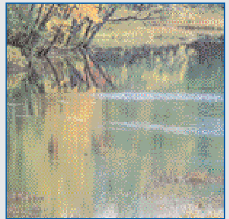
In the past, waste waters were left directly in natural waters, without treatments.