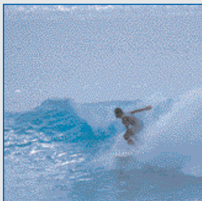
Water Quality Control